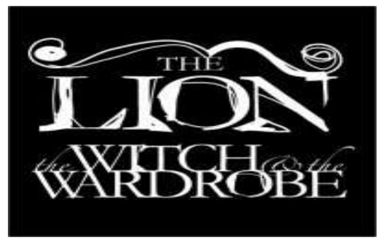
December 9th,10th,11th December 16th,17th,18th