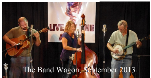
The Band Wagon, September 2013

A bluegrass musician, native to the St. Albans area. This performance is a fund raiser for ‘Toys for Tots’